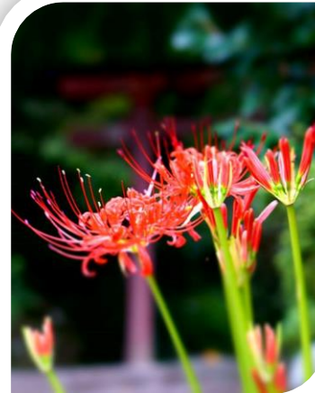
October: Red Spider lily