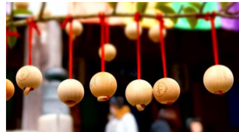
Dragon Wish-Granting Balls