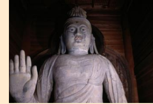
Nyoirin Kannon / Hon-do Hall