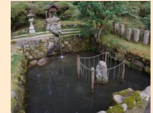
The legend of “Dragon Lid”