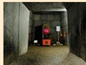
Monjyu Nishi-Kofun Mound/ Onmyodō