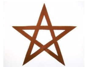
The Kikyō Pentagram

These philosophies merged into one and people applied it in their daily life. The philosophy, introduced to Japan in the 6 th century, was an accepted method to forecast fortunes and developed uniquely in Japan as “ Onmyō-dō ”.