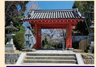
Omote-sanmon Gate/ Seasonal attractions