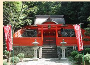
Hakusando Shrine/ Observatory/ Abe Seimei-do