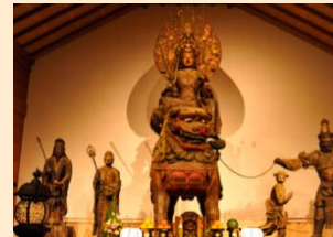
Tokai Monjyu statue (National Treasure)